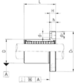
LMK8 Bearing 2D drawings and 3D CAD models